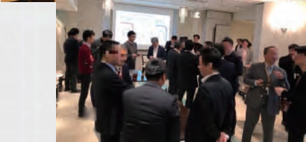
Side Event with Japanese FSA and International Speakers