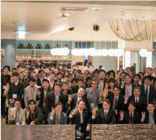
Offline Networking Event with LDP Lawmakers

JCBA's mission is to promote the domestic digital asset industry's growth. This is achieved by leveraging expertise from member professionals in technology, taxation, accounting, law, and business. JCBA conducts research, formulates policy recommendations, engages in advocacy, and fosters talent development to support industry growth.